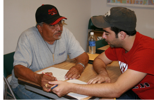
One-on-one literacy tutoring.

With an average of 650 students per year, Literacy Lubbock staffs over 100 volunteer instructors for both classroom and private instruction. This allows them to have small class sizes, as well as provide one-on-one tutoring as needed. Students entering the GED program are first tested with the Wonderlic General Assessment of Instructional Needs (GAIN)® basic skills test, which provides the detailed diagnostics needed to quickly place students in the appropriate level classes.