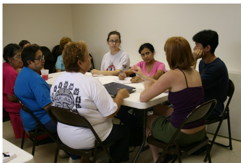
Literacy Lubbock ESL conversation class.

Literacy Lubbock, a non-profit partner agency of the United Way, provides free English and math classes to adults working towards their GED. In addition, the agency provides a variety of other educational opportunities, including literacy tutoring, English as a second language (ESL) classes, college prep, and assistance for adults with dyslexia.